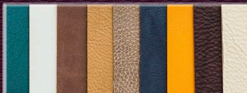
G4 - Genuine Leather