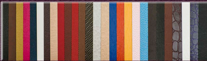
G1 & G2 - Bonded Leather & Non-Leather

A slip cover is an economical way to protect your album investment. Slip covers are custom designed to match your album.