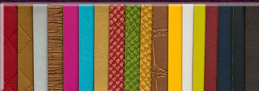
G3 - Eco Materials