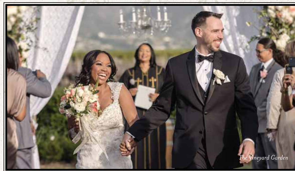
The Vineyard Garden