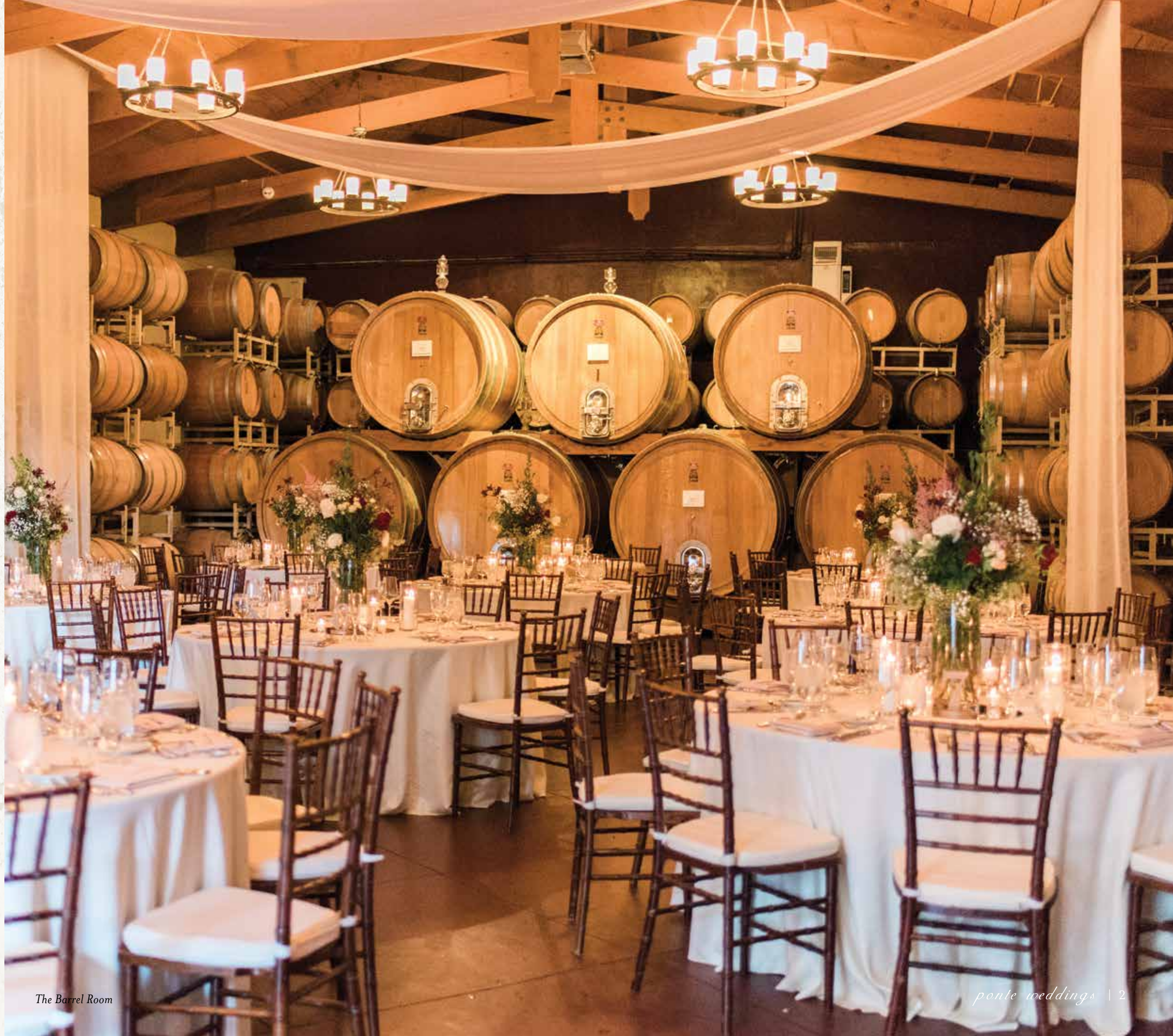
The Barrel Room

Complimentary one-night stay at Ponte Vineyard Inn on your wedding night