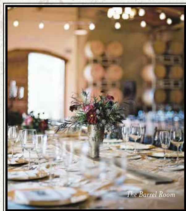
The Barrel Room