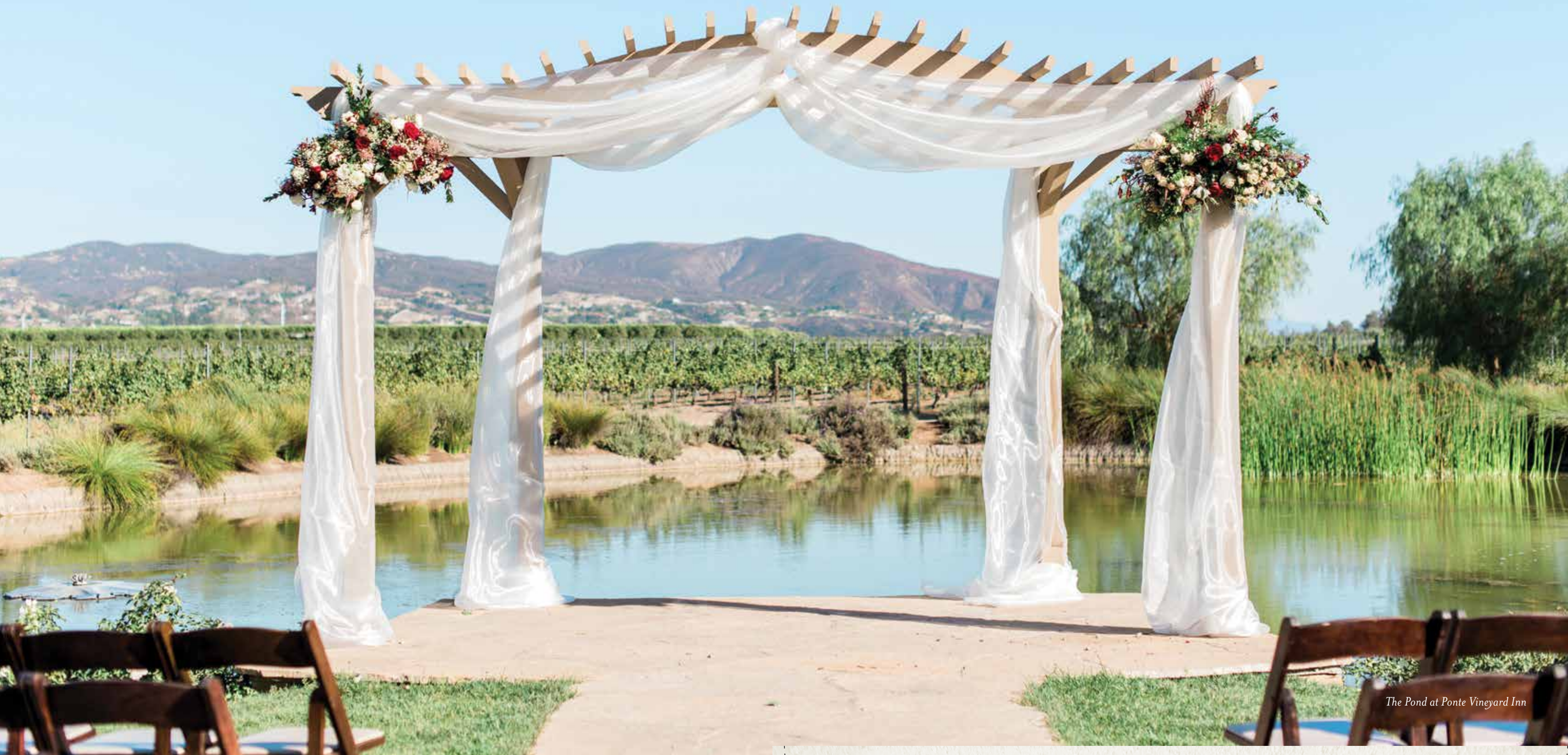
The Pond at Ponte Vineyard Inn

Business card slits graphic, business card outline graphic and unglued flap die line graphic are for illustration and relative position purposes only and do not print.