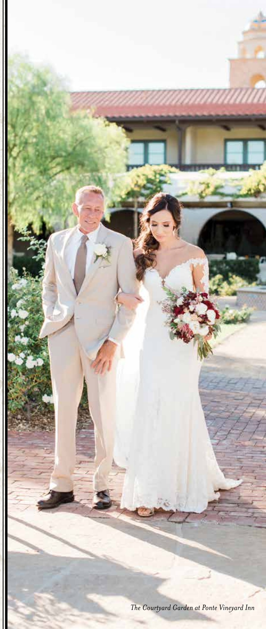
The Courtyard Garden at Ponte Vineyard Inn