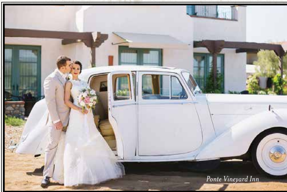
Ponte Vineyard Inn

A complimentary King Room is included in your Wedding Package on the night of your wedding, or ask the Front Desk about upgrading to one of our suites. Ponte Vineyard Inn also offers in-room massages and other spa treatments.