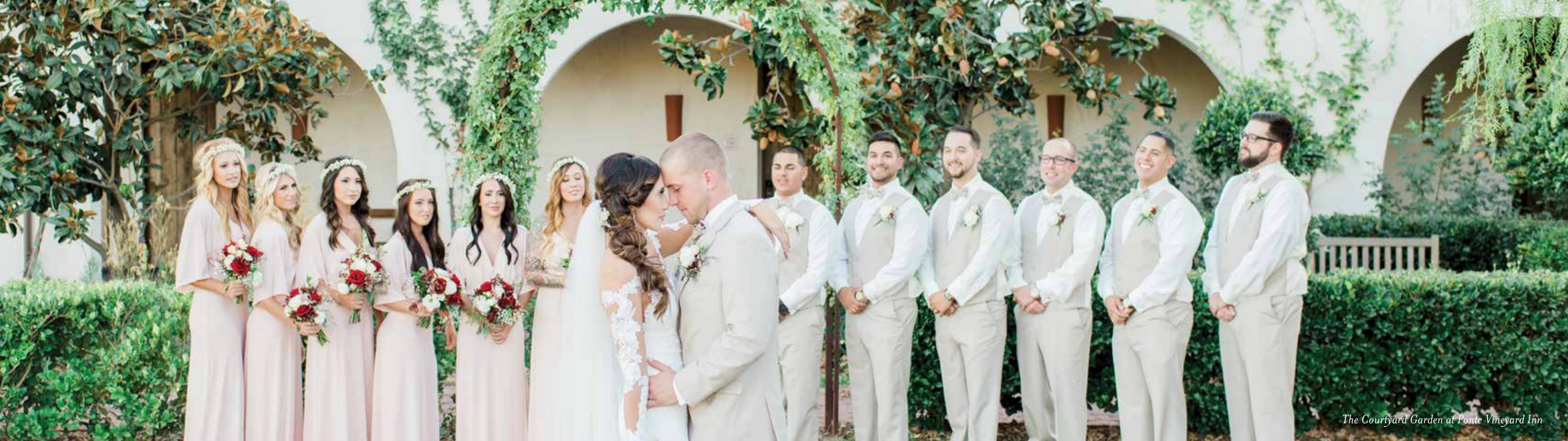
The Courtyard Garden at Ponte Vineyard Inn