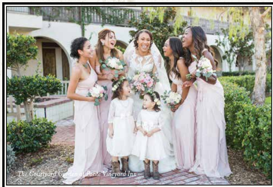
The Courtyard Garden of Ponte Vineyard Inn

Imported and domestic cheeses that may include: smoked gouda, sage Derby, Maytag bleu cheese, Stilton, Gruyère de comté, English cheddar, provolone, baguette slices, gourmet crackers