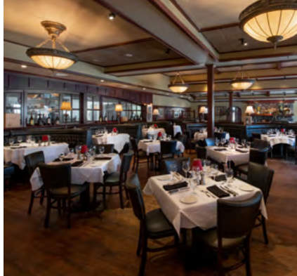
RED COACH DINING AREA