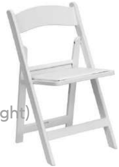
Ceremony and reception chair