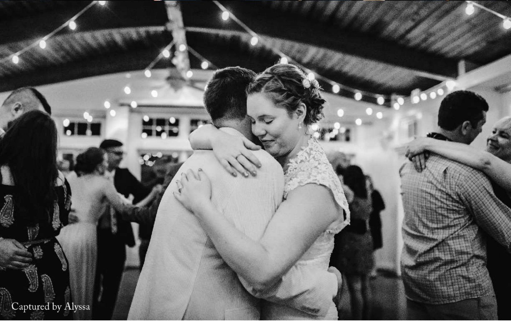
Captured by Alyssa