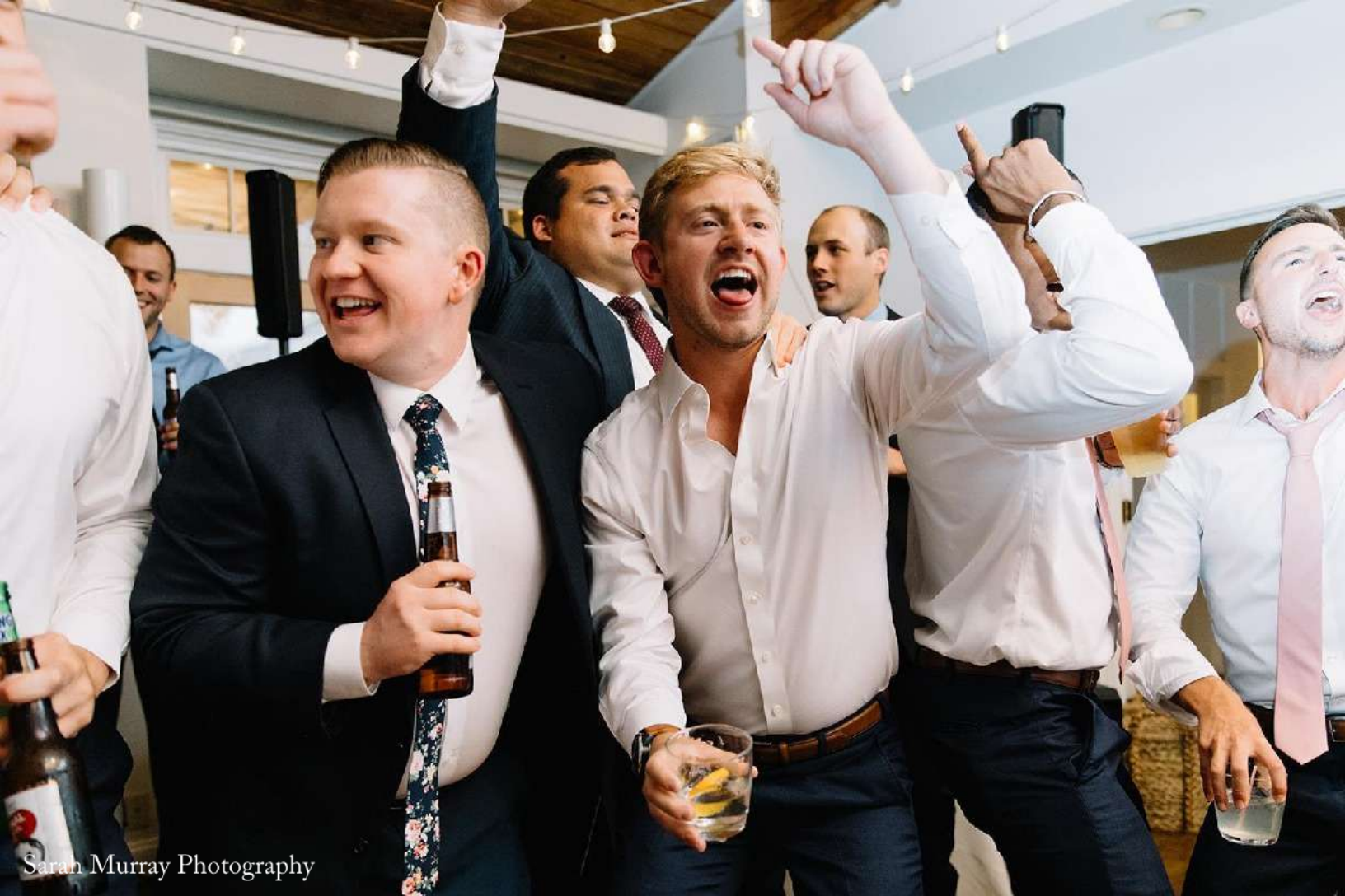
Sarah Murray Photography