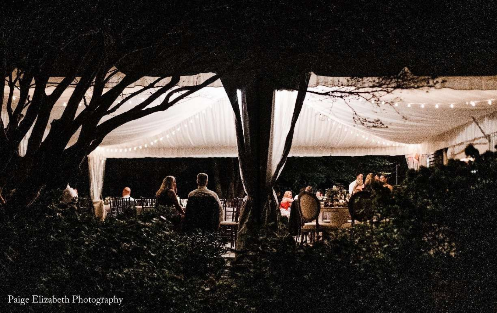
Paige Elizabeth Photography