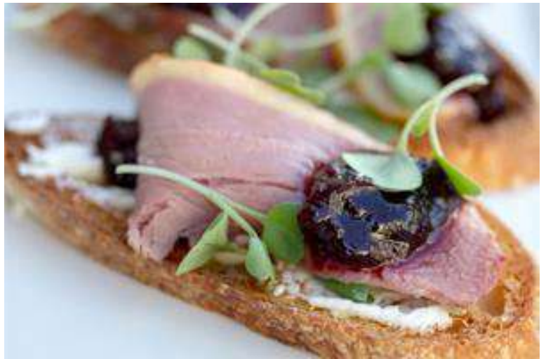
SMOKED DUCK BREAST CROSTINI