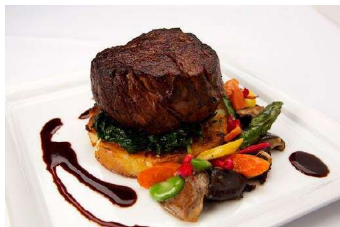
PLATED FILET MIGNON OF BEEF