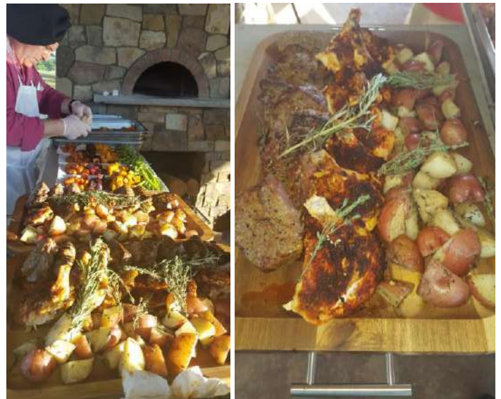
FAMILY STYLE PLATTERS