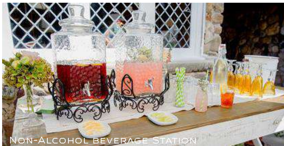
NON-ALCOHOL BEVERAGE STATION

HOUSE OR TITOS VODKA AND ALL BLOODY MARY ACCOMPANIMENTS TO MIX YOUR OWN BM MASTERPIECE