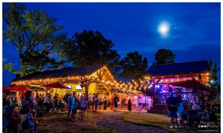
COLLOCA ESTATE WINERY PAVILION.

SO, IF OUR PROPERTY IS YOUR FIRST CHOICE, YOU CAN BE AT EASE IN PLACING YOUR INITIAL DEPOSIT TO RESERVE YOUR DATE AND RELAX KNOWING YOUR DATE IS RESERVED AND SECURED JUST FOR YOU.