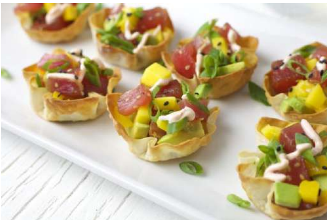
AHI TUNA BITES