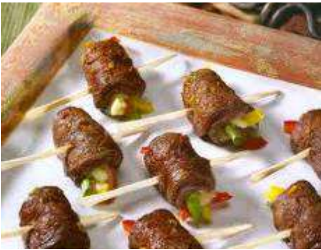
HIBACHI BEEF SKEWERS