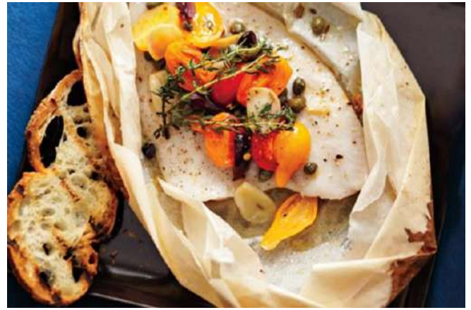
DOVER SOLE EN PAPILOTE

ASSORTED DINNER ROLLS PRETZEL ROLLS SOURDOUGH ROLLS GARLIC BREAD CORN BREAD