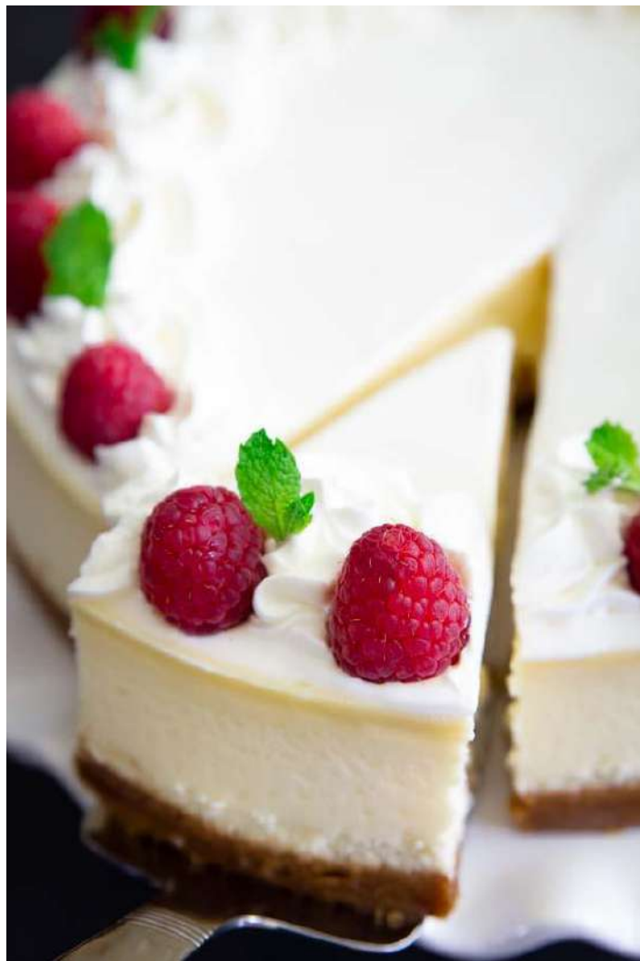
NEW YORK CHEESECAKE