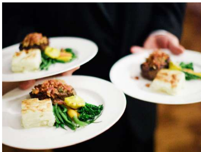
PLATED DINNER SERVICE