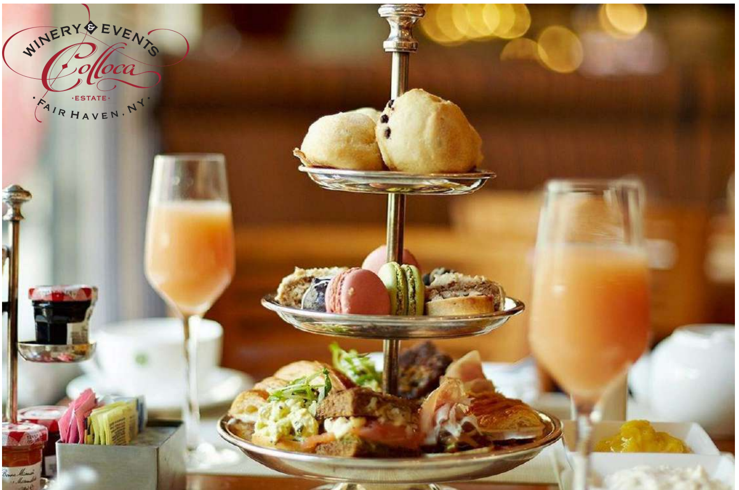
ENGLISH HIGH TEA PARTY BRUNCH

HOUSE MADE SCONES WITH HOMEMADE JAM AND CLOTTED CREAM YOGURT PARFAITS INDIVIDUALLY PREPARED WITH GRANOLA AND FRESH BERRIES FRESH FRUIT SALAD VINEYARD SALAD WITH GRAPES, WALNUTS AND BRIE QUICHE FLORENTINE WITH CHEESE, SPINACH AND MUSHROOMS ASSORTED FINGER SANDWICHES TURKEY & SPINACH, HAM & CHEESE, EGG SALAD, & TUNA SALAD WITH CUCUMBER SALMON GRAVLAX WITH TOASTS, LEMON, CREAM CHEESE, CAPERS, & RED ONION TEA CAKES