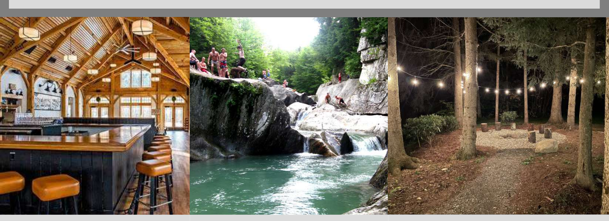
Vermont Brewery Tours

Guided experiences are available through both Barn staff members and local businesses. Rental equipment can be arraigned for any outdoor activity as well as transport to and from your desired destination.