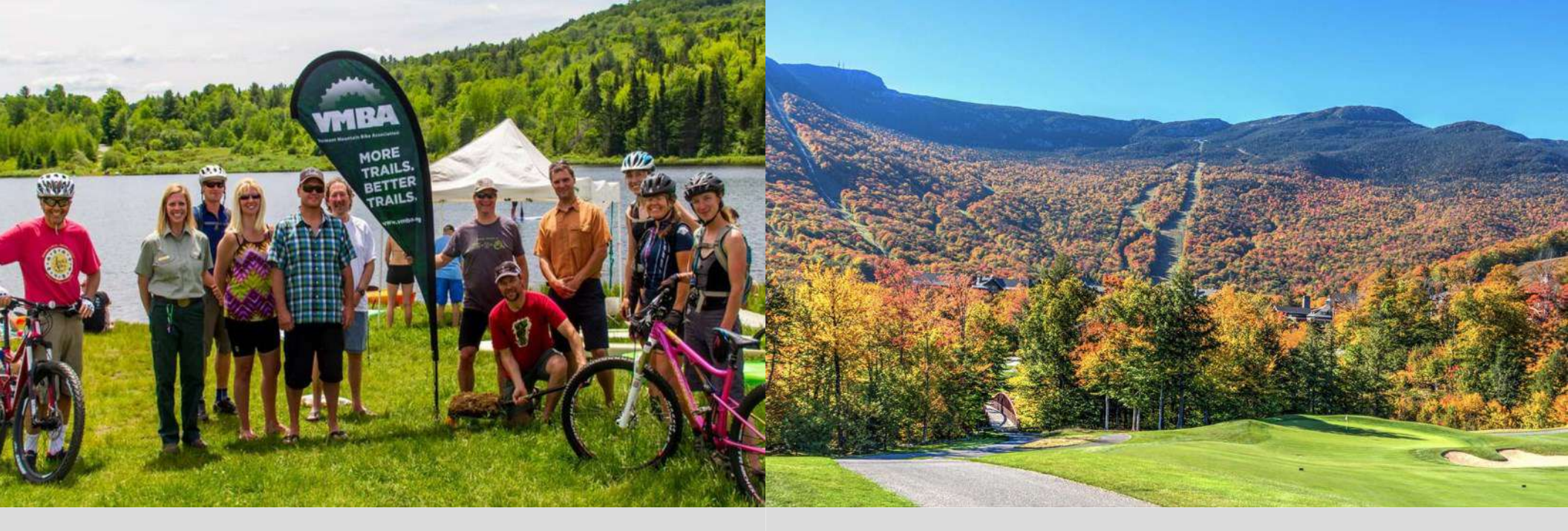
Guided Mountain Bike Tours with Mad River Riders