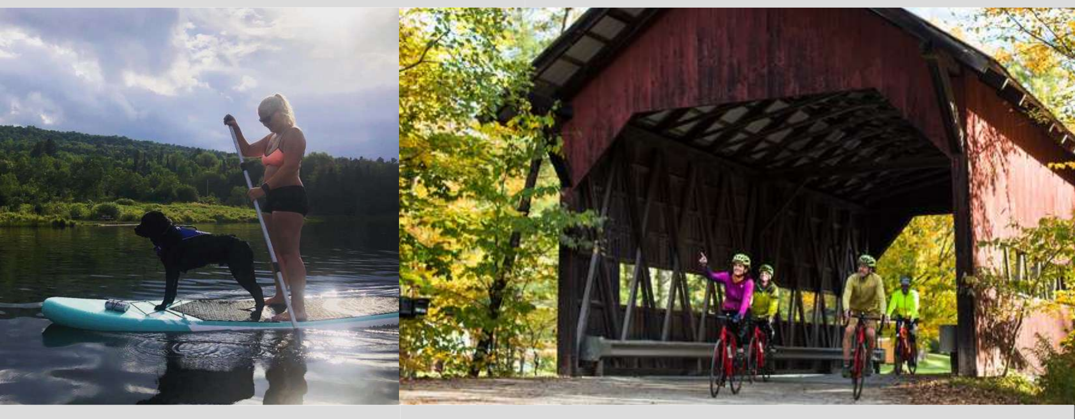
Paddleboard at Blueberry Lake