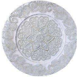
Mandala Silver Glass