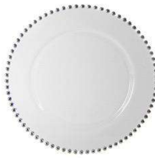
Silver Bead Glass