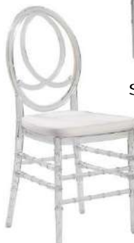
Clear Phoenix Chair