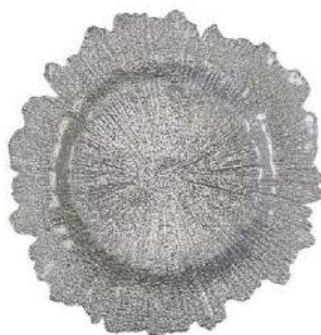
Silver Reef Glass