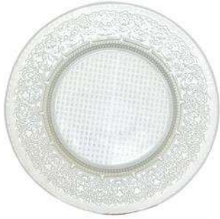
Vintage Pearl Glass