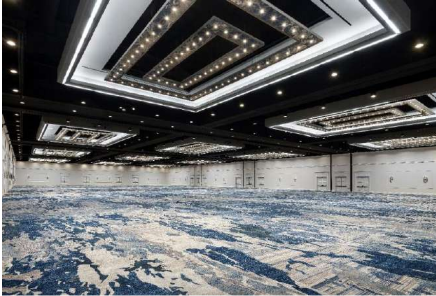
Bonnet Creek Ballroom

Our expansive ballrooms can effortlessly hold any size wedding. Ideal for large galas, this flexible space can easily be transformed to create the wedding of your dreams