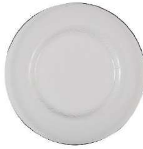
Silver Rim Frosted Glass