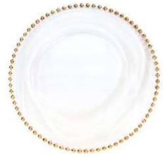
Gold Bead Glass