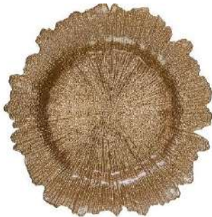
Gold Reef Glass