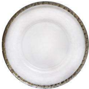
Silver Rim Glass