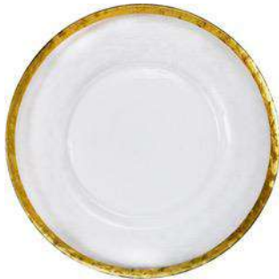
Gold Rim Glass