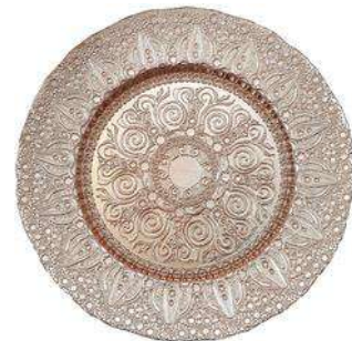
Morocco Blush Glass