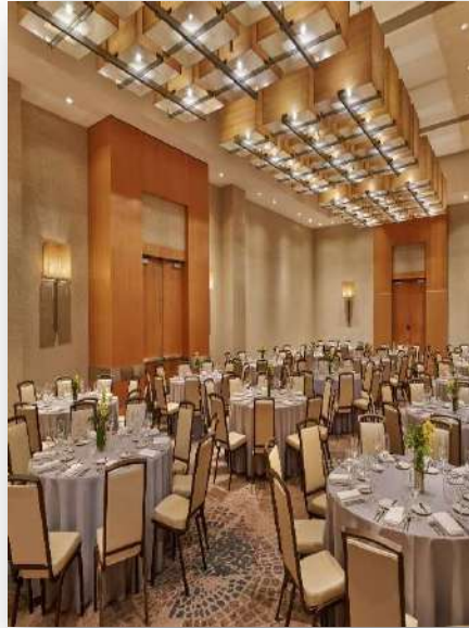
LINDBERGH A BALLROOM