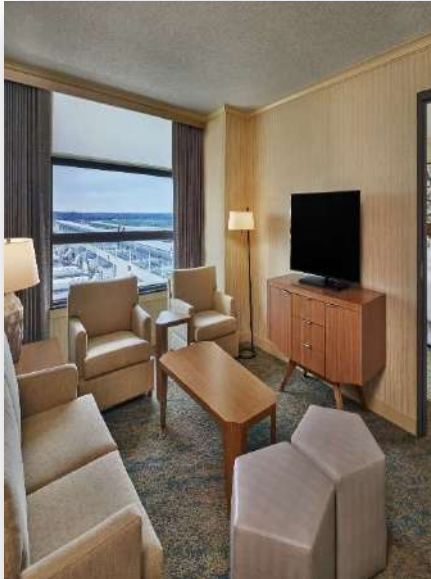
ONE BEDROOM SUITE