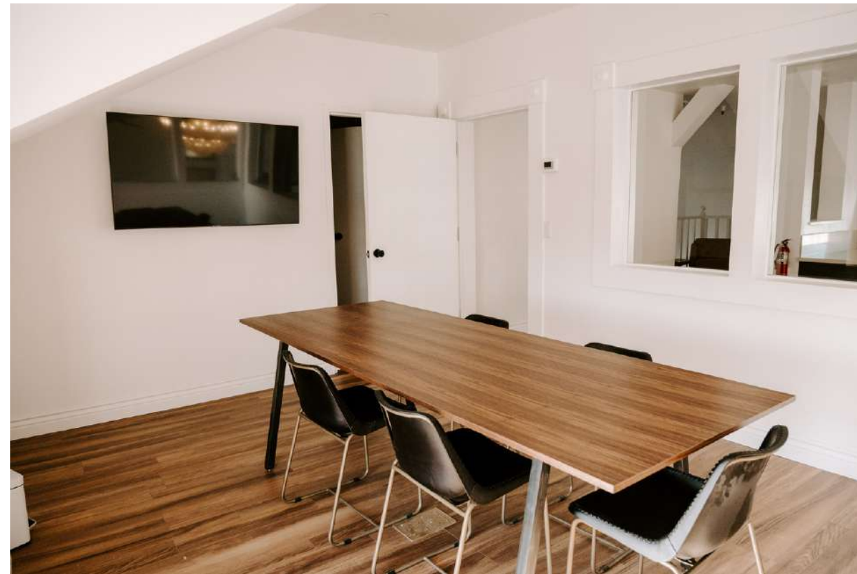
Conference 2 (8-10ppl) $50/hr