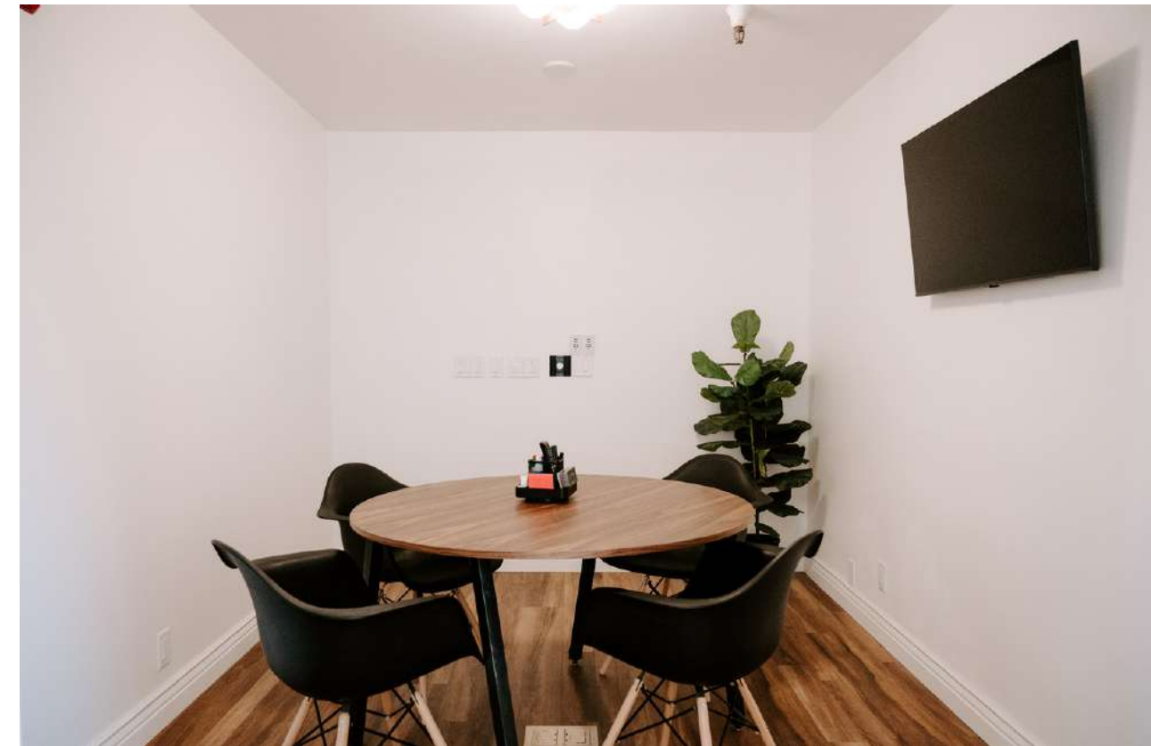
Conference 3 (4ppl) $35/hr

Board Room (26ppl) $150/hr Includes Coffee Service