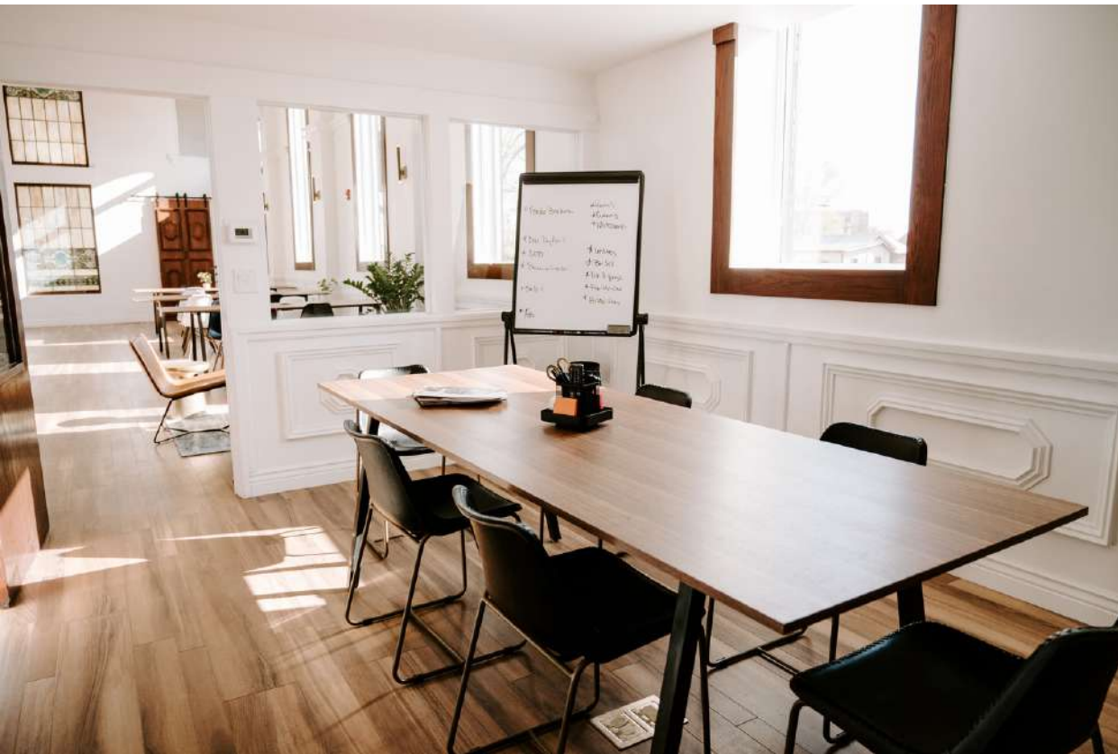
Conference 1 (8-10ppl) $50/hr