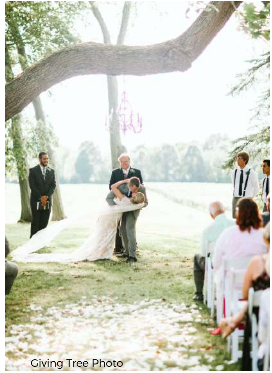
Giving Tree Photo