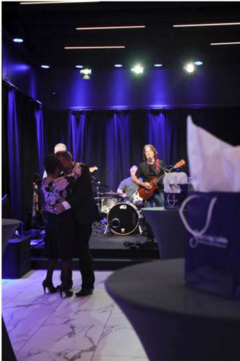
Dancing at a Sissy's Log Cabin Employee Appreciation Event