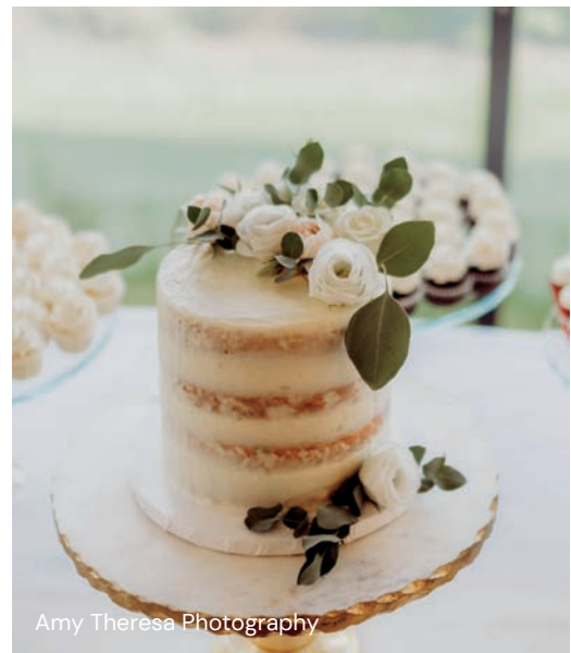
Amy Theresa Photography