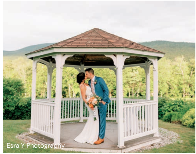
Esra Y Photography