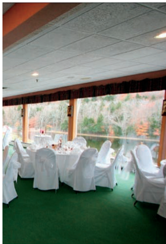
The Greenery (Private Room)

Buffet menu can be customized to your needs. Please give all special food or beverage requests to your wedding coordinator one month in advance. Fees applicable.