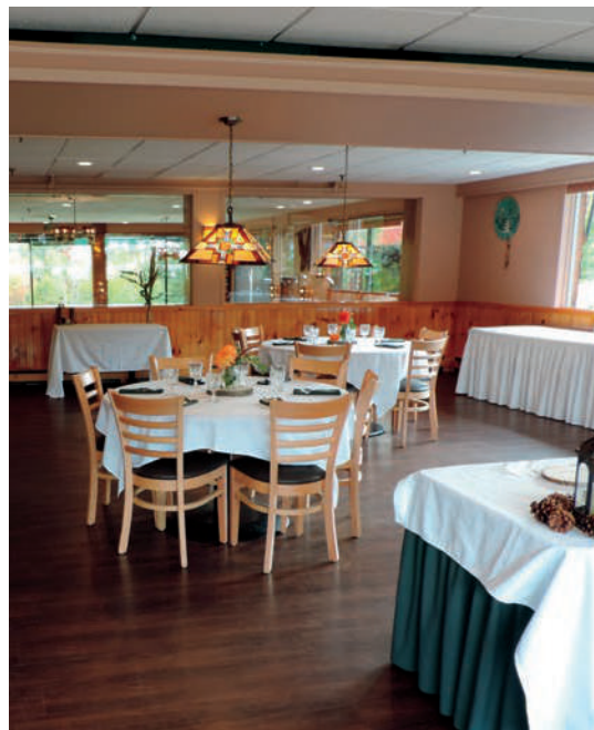
The Profile Room