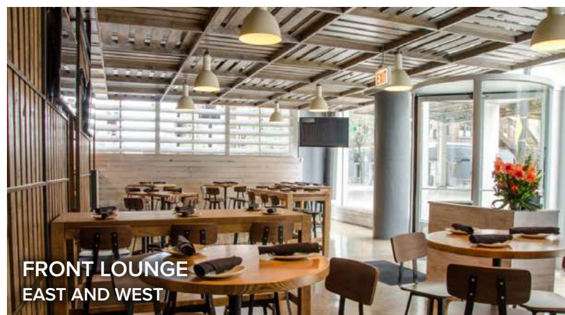
FRONT LOUNGE EAST AND WEST