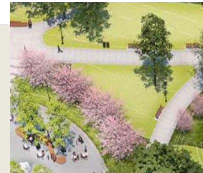
NE PLAZA 316 GUEST CAPACITY