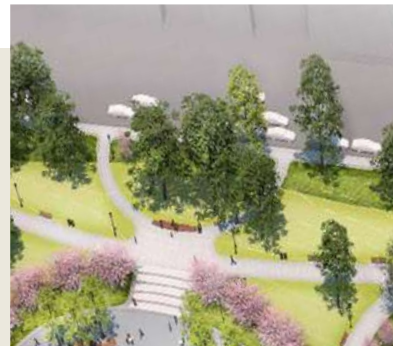
OVERLOOK 375 GUEST CAPACITY