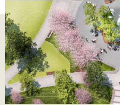
SW PLAZA 173 GUEST CAPACITY