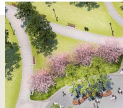
NW PLAZA 364 GUEST CAPACITY