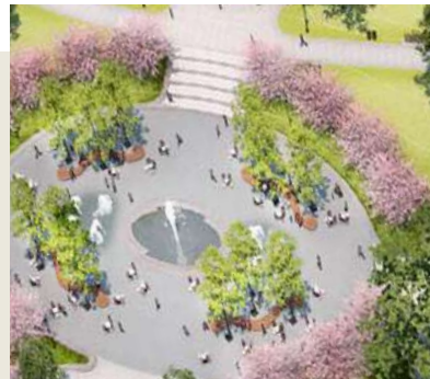
FOUNTAIN PLAZA 1,804 GUEST CAPACITY