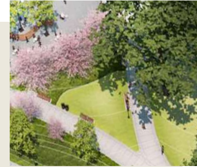
SE PLAZA 145 GUEST CAPACITY