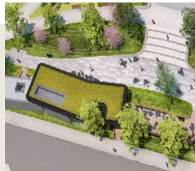
CAFE PAVILLION COMING SOON