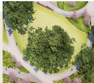
EAST LAWN 1,236 GUEST CAPACITY