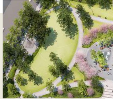
WEST LAWN - FULL 2,499 GUEST CAPACITY