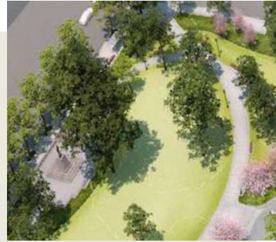
WEST LAWN - HALF 1,250 GUEST CAPACITY