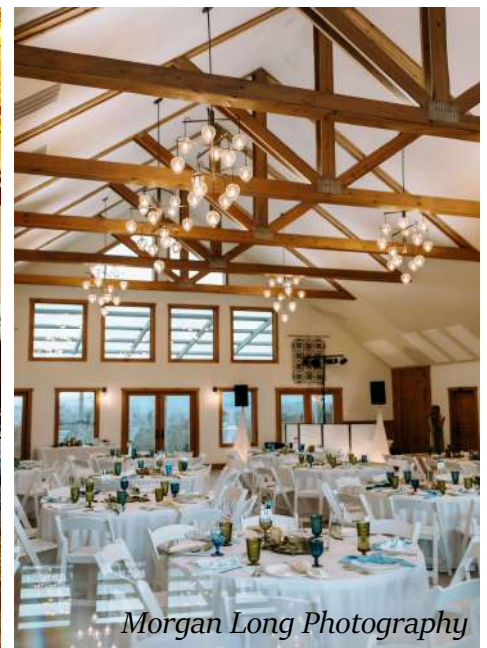
Morgan Long Photography