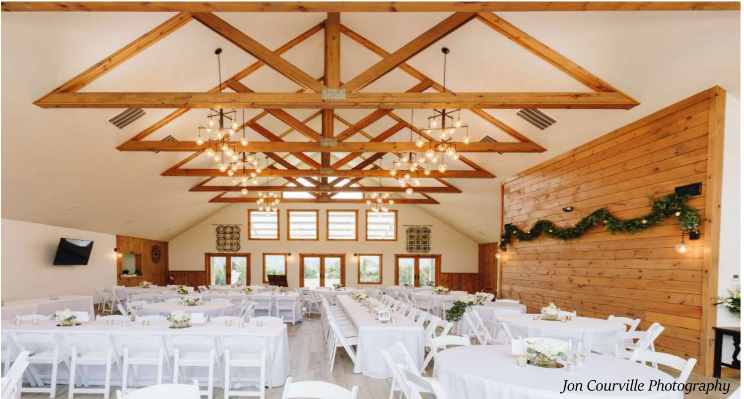
Jon Courville Photography

This 3,600 square foot, 200-person capacity reception hall has plenty of room for seating, catering, dancing and anything else you can imagine. This versatile reception hall can be set up in the way that best suits your needs, and our staff will be here to set up the tables, chairs and in house linens to make it easier for you. We also have some select décor options that you are more than welcome to use like easels, lanterns, vases and more!