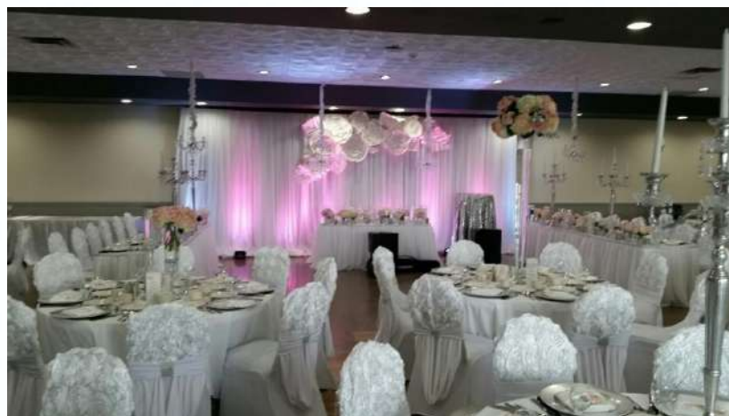
Larters at St. Andrews