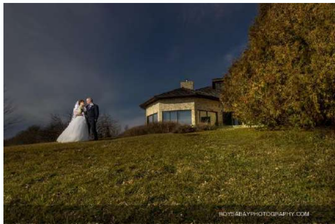
Larters at St. Andrews