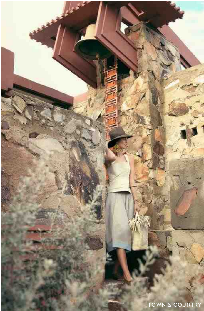
TOWN & COUNTRY