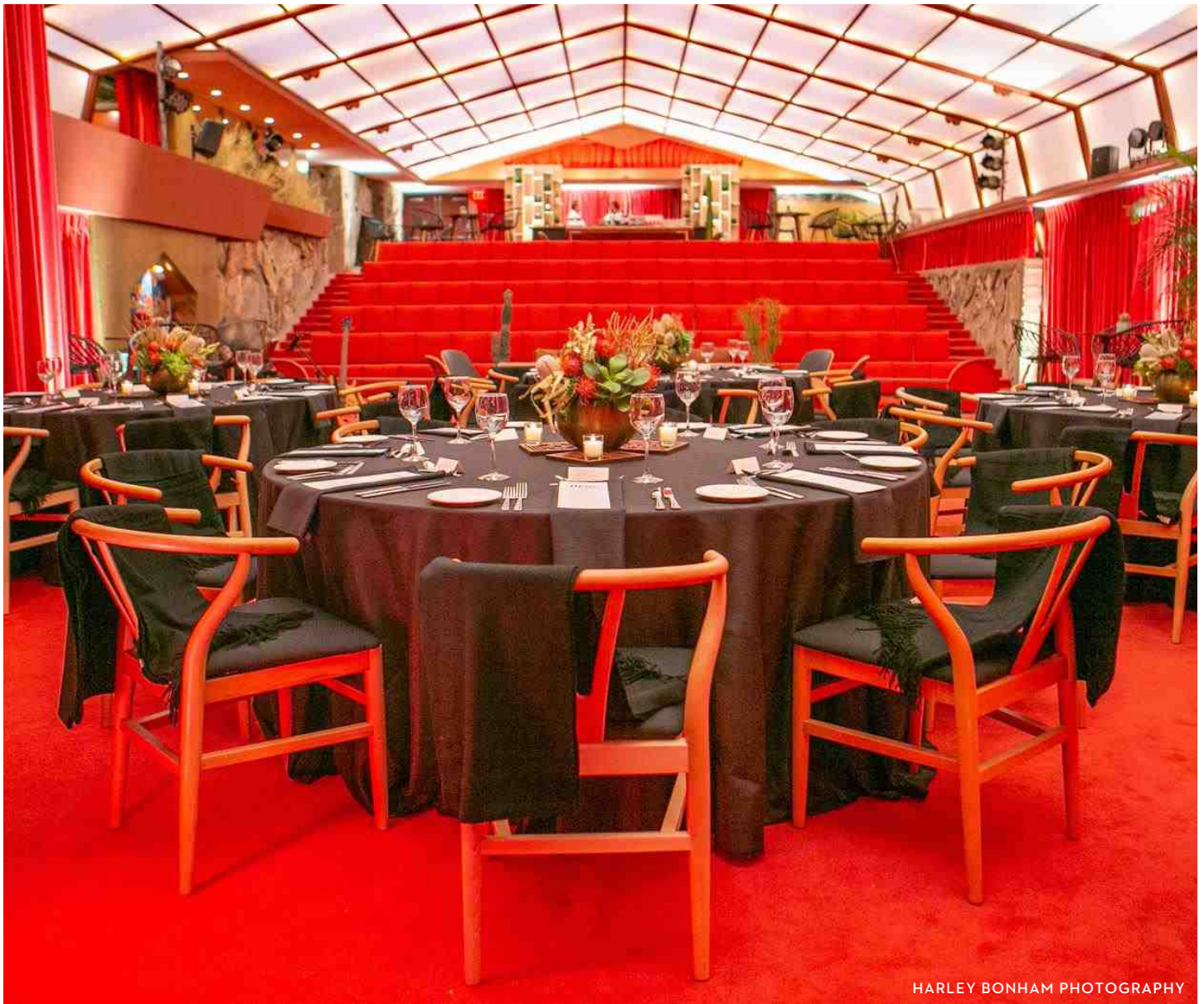
HARLEY BONHAM PHOTOGRAPHY