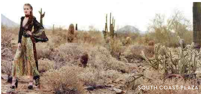
SOUTH COAST PLAZA