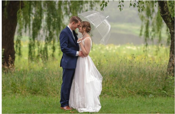
Capture the Moment

Couples may schedule any four-hour time block for a wedding ceremony. This time block may be anytime between the hours of 8 am to 9 pm. Weddings are not scheduled at Holy Wisdom Monastery during Holy Week, on Easter Day, Thanksgiving Day, Thanksgiving weekend and Christmas Eve through New Year's Day.