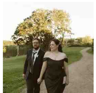
Caitlin Harle Photography