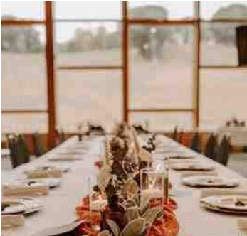
Aurora Pines Photography