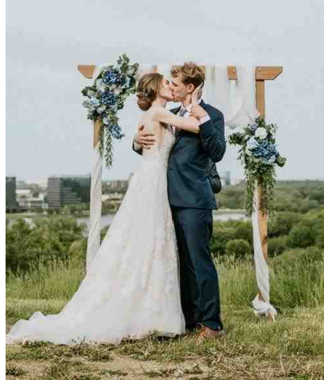
Wennicha Yang Photography