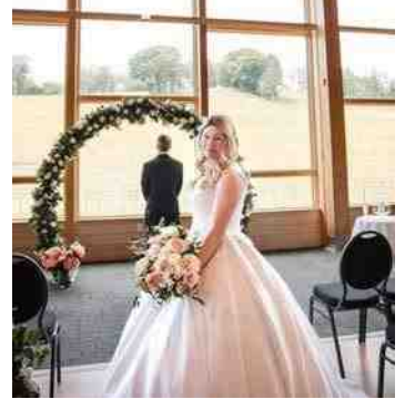
Ashley Beckman Photography