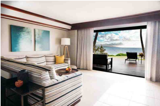
② Guest Accommodations