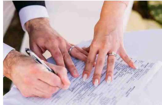
③ Ceremony & Paperwork