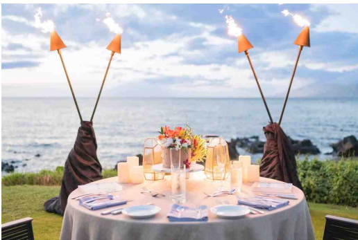
④ Food & Drink