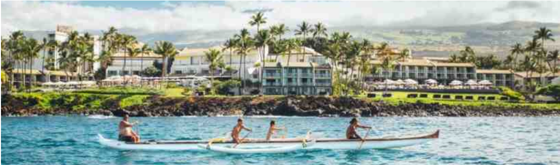
① Resort Experiences

Let our team of experts custom tailor every detail of your special day.