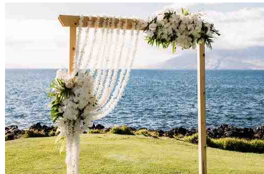
⑤ Creative Partners