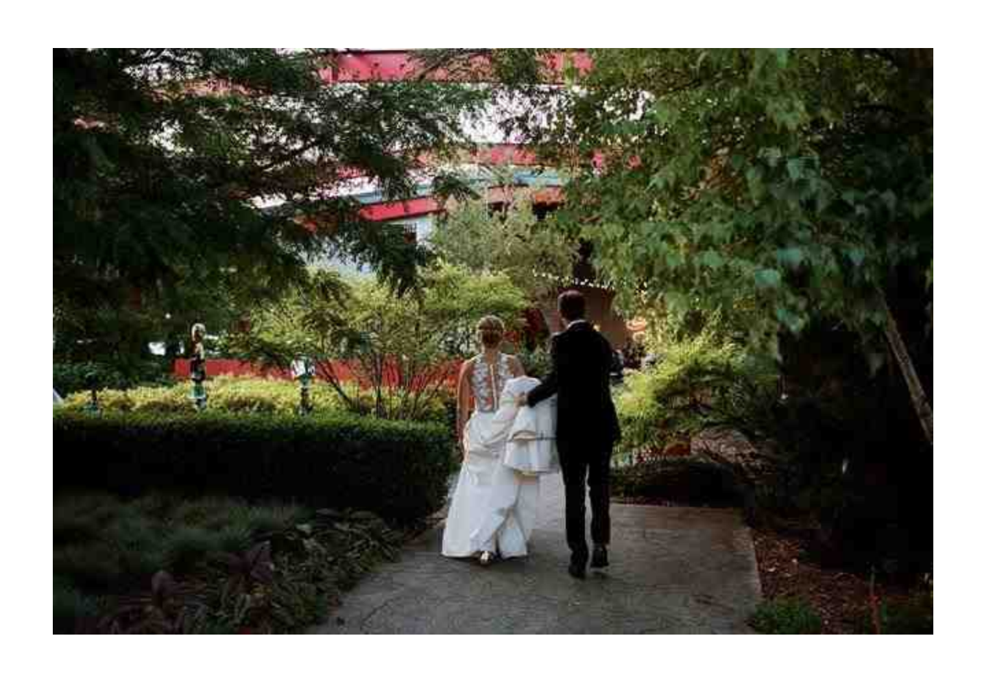
Saugatuck Center for the Arts Wedding Guide