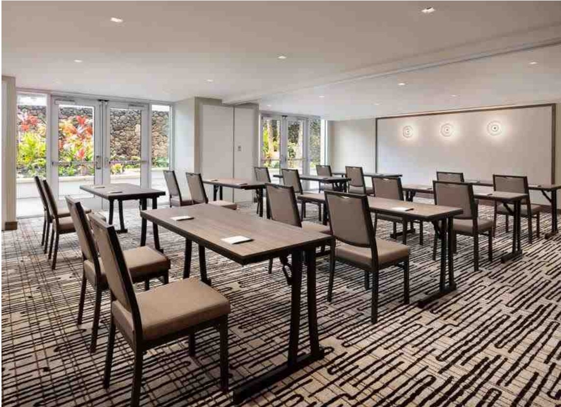
Two Bishop Rooms Combined in Classroom Setup