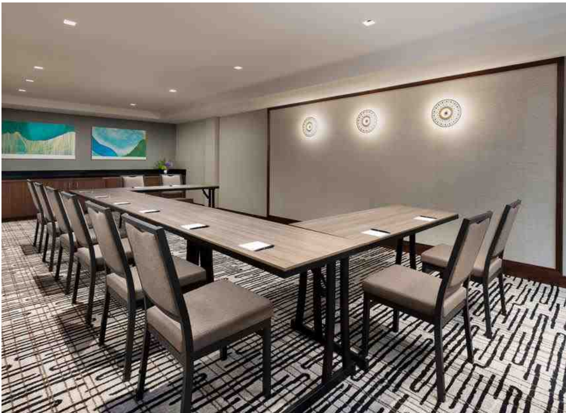
Single Bishop Room in U-Shape Setup