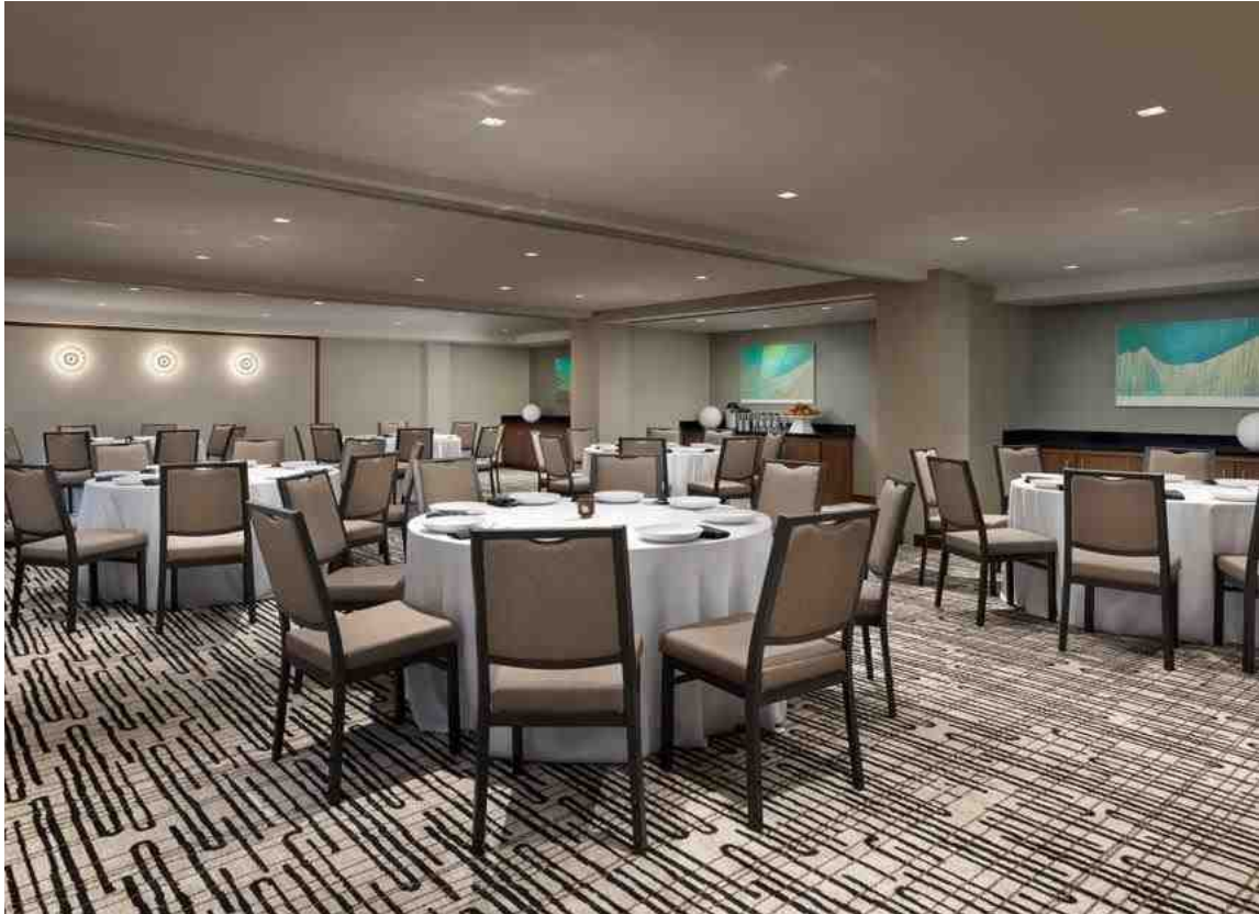
Bishop Ballroom Social Setup