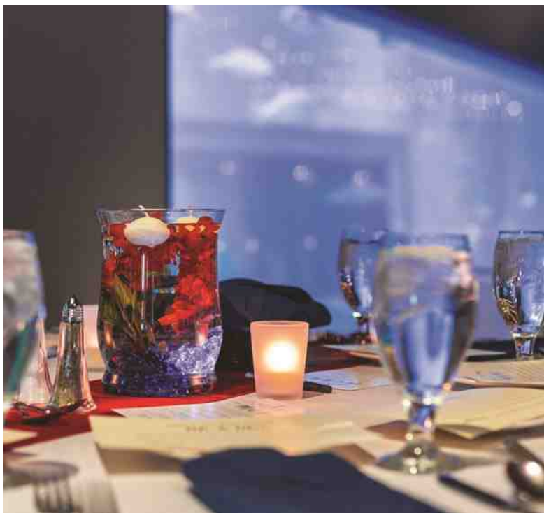
Aquarium: Toledo Zoo & Aquarium