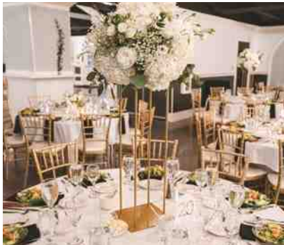
Malawi: Toledo Zoo & Aquarium

Venue minimum includes food, beverage, equipment, and any additional rentals