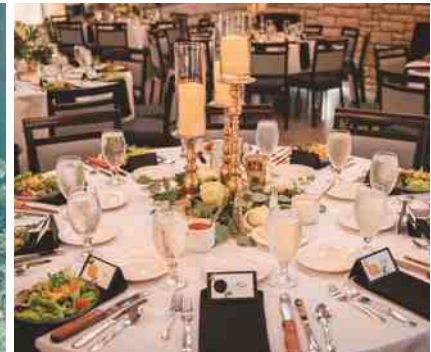
Great Hall: Toledo Zoo & Aquarium