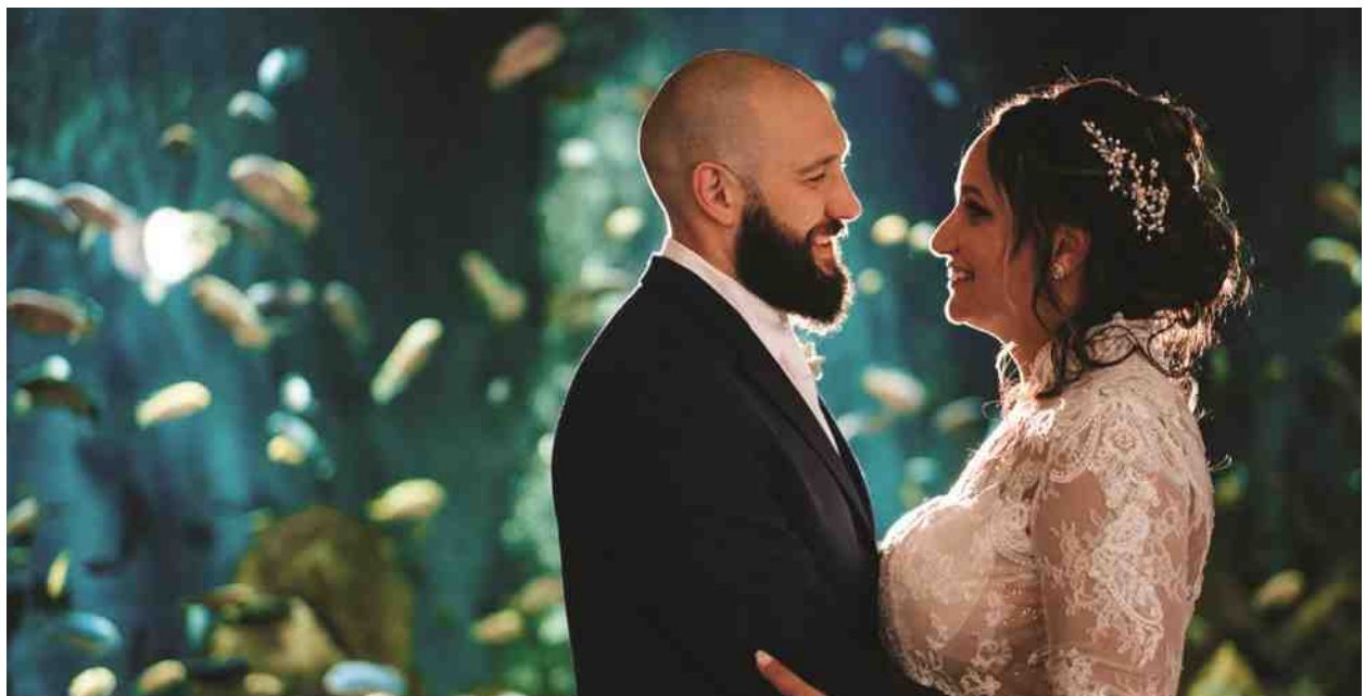
Malawi: Toledo Zoo & Aquarium

*All facilities are subject to availability.