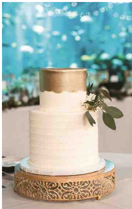
Malawi: Toledo Zoo & Aquarium