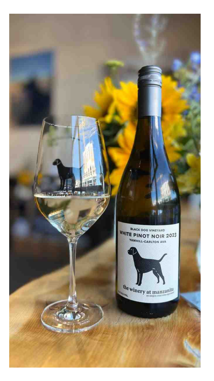
available wines subject to change