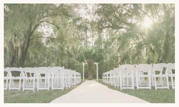
Twin Oaks Corral