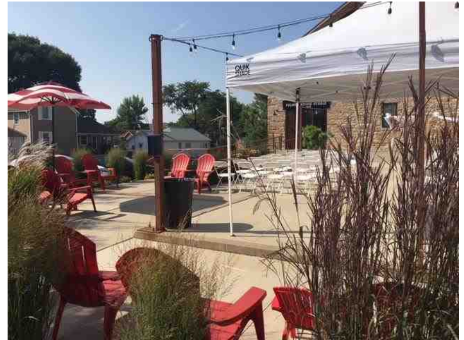
White 10' X 20' "Pop Up Tent" Option