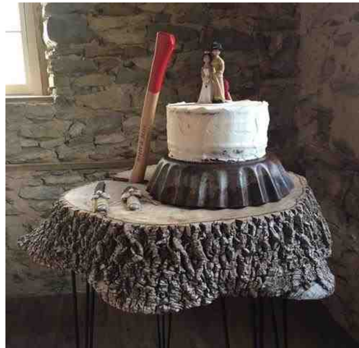
Wood Chunk Table for Deserts