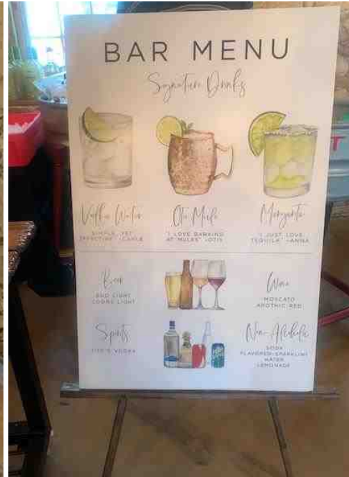
BAR MENU TEMPLATE https://templett.com/design/v2