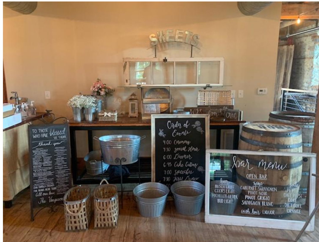
Our Latest Complimentary Decorating Accessories