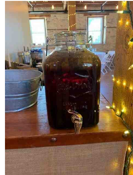
5 water, tea, and lemonade glass dispensers