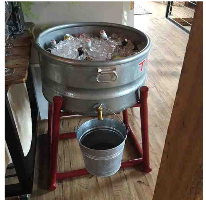
Large Galvanized Tubs "Self-Serve" eliminates bartenders' expense just grab and go