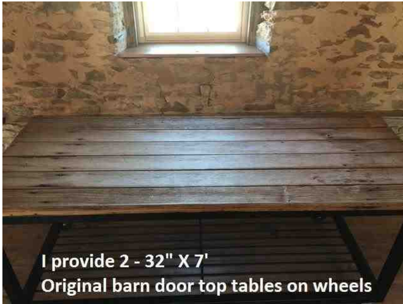
I provide 2 - 32" X 7' Original barn door top tables on wheels