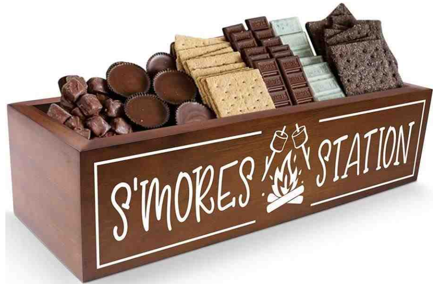
After Dark Bonfire and S'mores ...we even provide the S'more sticks and S'more Station box! (Chocolate, Marshmallows, Graham Crackers not included)