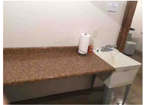
Prep Kitchen-Oven range-freezer-refrigerator-counter space and tub sink.