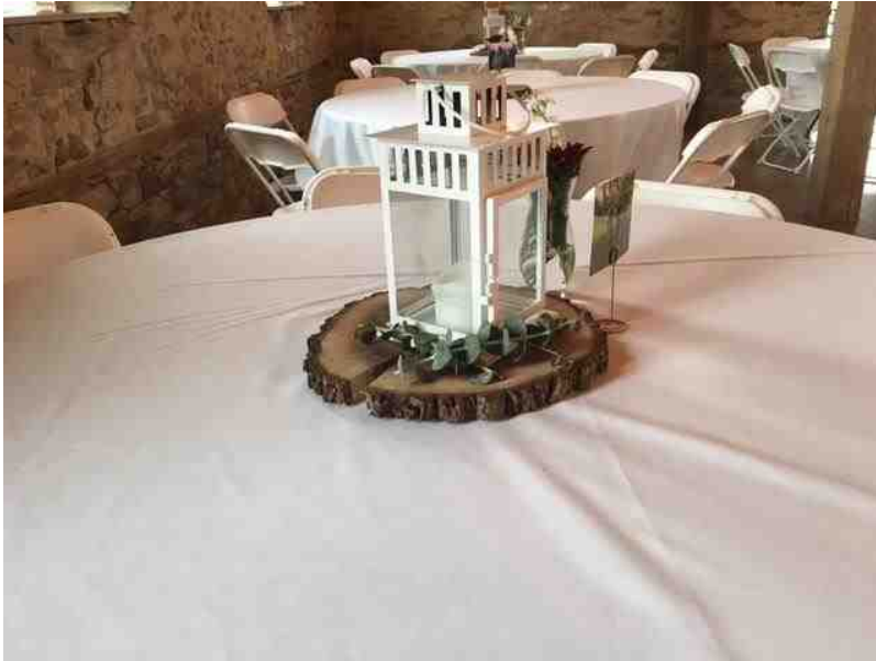
Typical center piece arrangement using all PHS acc.