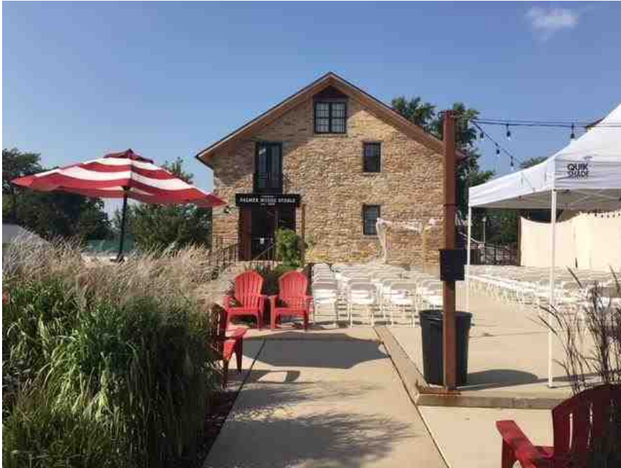
Outdoor Ceremony Seating