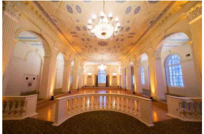
The Imperial Ballroom

The Biltmore, located in midtown Atlanta, is a perfect venue for corporate celebrations, weddings, and association meetings offering event attendees a uniquely elegant experience.