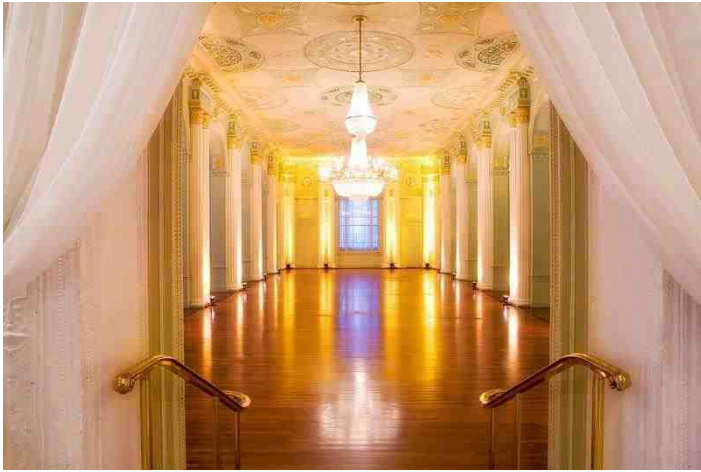
The Georgian Ballroom