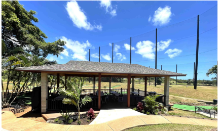
Town Deck - 50 people max/$300 for 3 hours