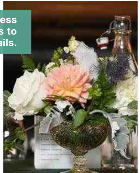
Table Arrangements .....$49 - $83