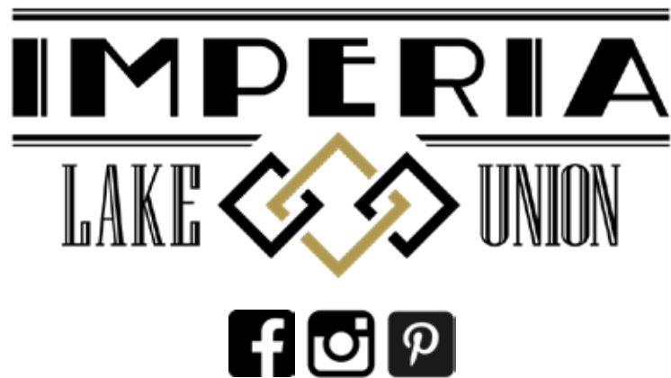
Photo credits available on our website's preferred vendors list. Thank you to our photographers and our lovely couples.