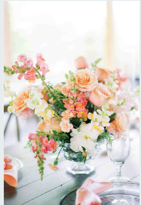
Heather Creed Photography