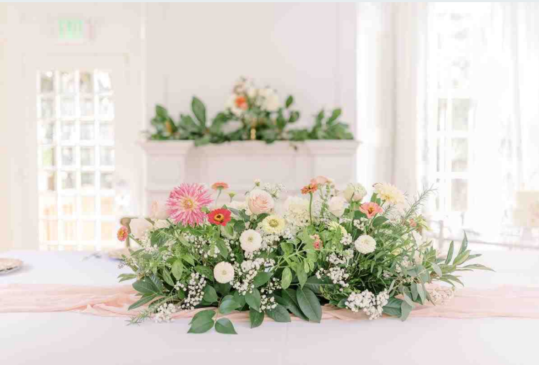
Liz Grogan Photography