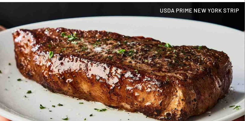
USDA PRIME NEW YORK STRIP

cauliflower, shaved brussels sprout, carrot, red pepper, baby kale, crispy chickpeas, lemon-garlic crema 910 cal