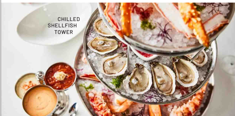
CHILLED SHELLFISH TOWER