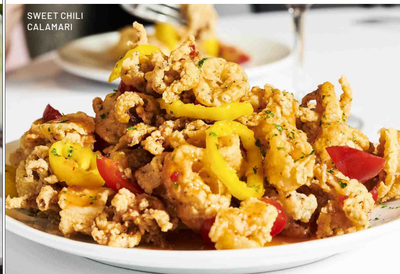
SWEET CHILI CALAMARI

†Price does not include sales tax, gratuity or applicable private dining fees.