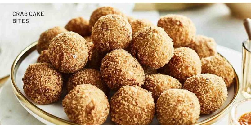
CRAB CAKE BITES