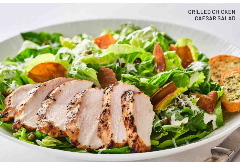
GRILLED CHICKEN CAESAR SALAD

†Price does not include sales tax, gratuity or applicable private dining fees.