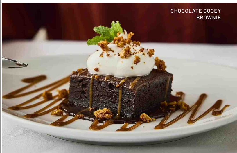
CHOCOLATE GOOEY BROWNIE