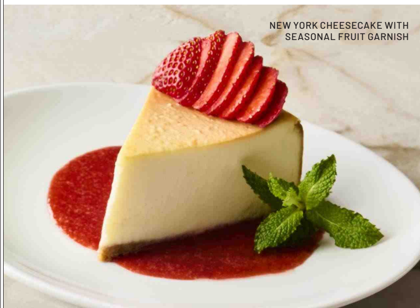
NEW YORK CHEESECAKE WITH SEASONAL FRUIT GARNISH