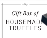
Gift Box of HOUSEMADE TRUFFLES

for your Guests to take home 300 cal (+7)