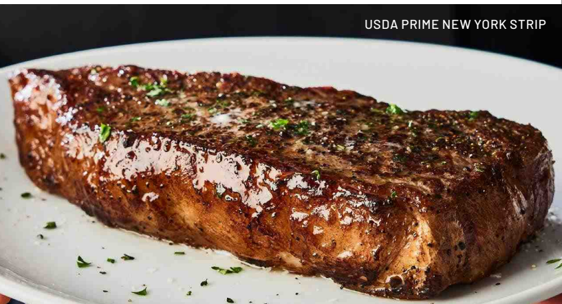
USDA PRIME NEW YORK STRIP

ROASTED PORTOBELLO & CAULIFLOWER STEAK crispy potato marrow with chimichurri & farro, asparagus and pickled onions with mushroom demi-glaze 1060 cal