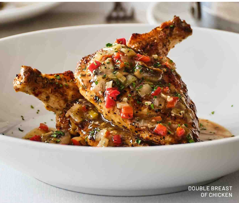
DOUBLE BREAST OF CHICKEN

crispy potato marrow with chimichurri & farro, asparagus and pickled onions with mushroom demi-glaze 1060 cal