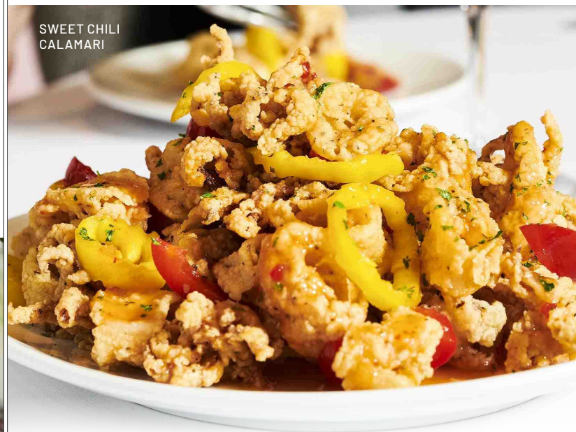
SWEET CHILI CALAMARI

featuring carrot cake, chocolate dipped strawberries, orange chocolate truffles 1970 cal | 30