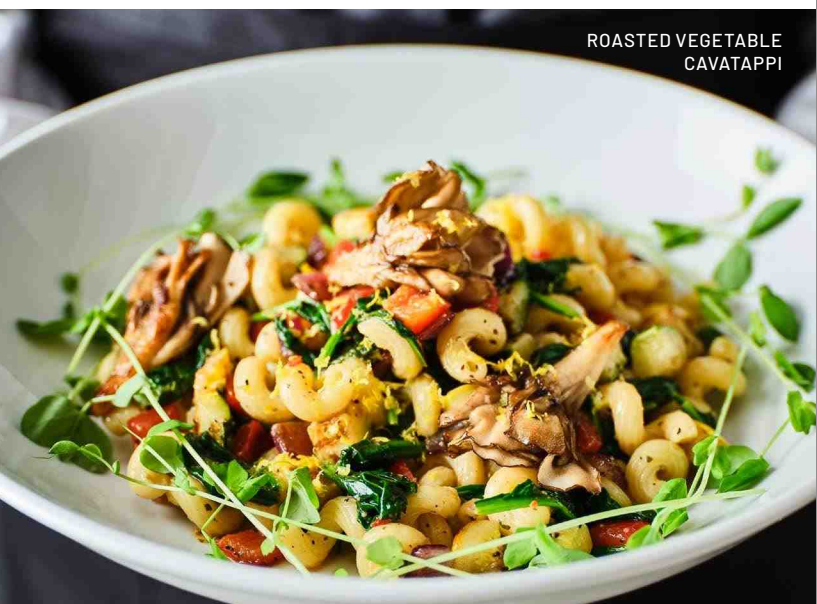
ROASTED VEGETABLE CAVATAPPI

roasted red bell pepper, cauliflower, red onion & maitake mushrooms, asparagus, sautéed spinach, herb olive oil, pea shoot tendrils 755 cal