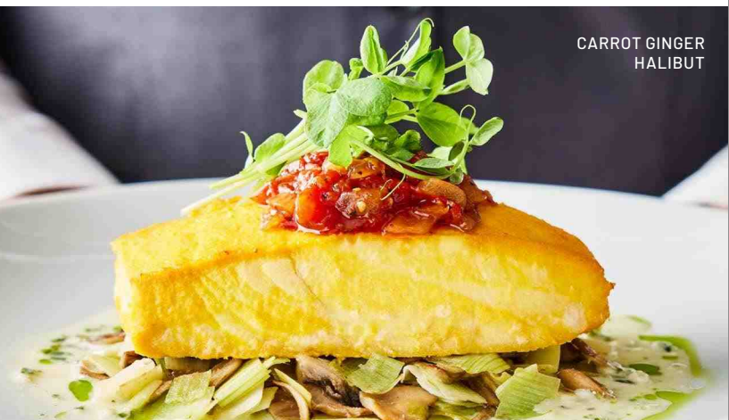
CARROT GINGER HALIBUT

crispy potato marrow with chimichurri & farro, asparagus and pickled onions with mushroom demi-glaze 1060 cal