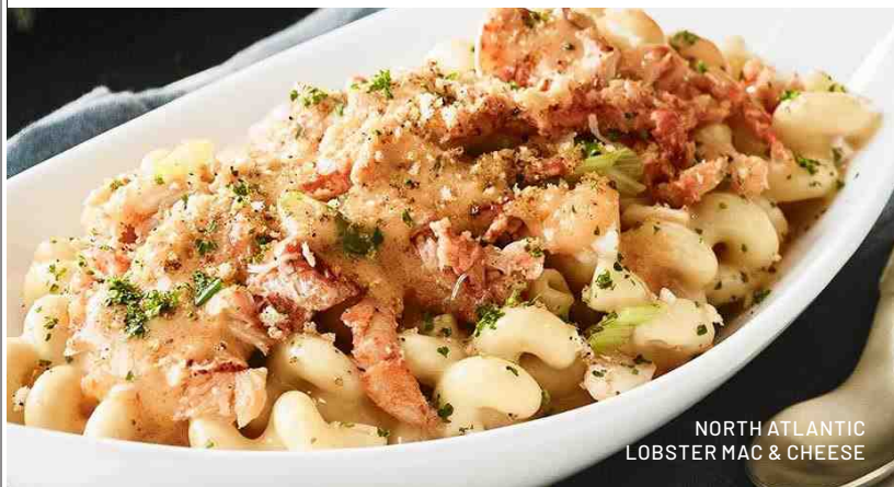
NORTH ATLANTIC LOBSTER MAC & CHEESE

tender lobster, cavatappi, smoked cheddar, chipotle panko breadcrumbs 1310 cal