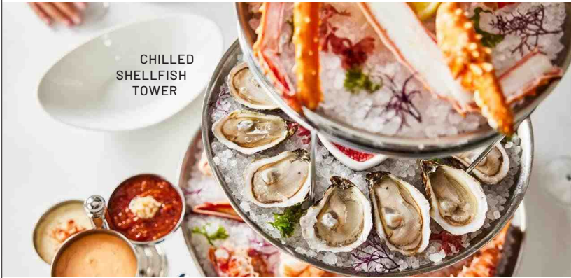
CHILLED SHELLFISH TOWER