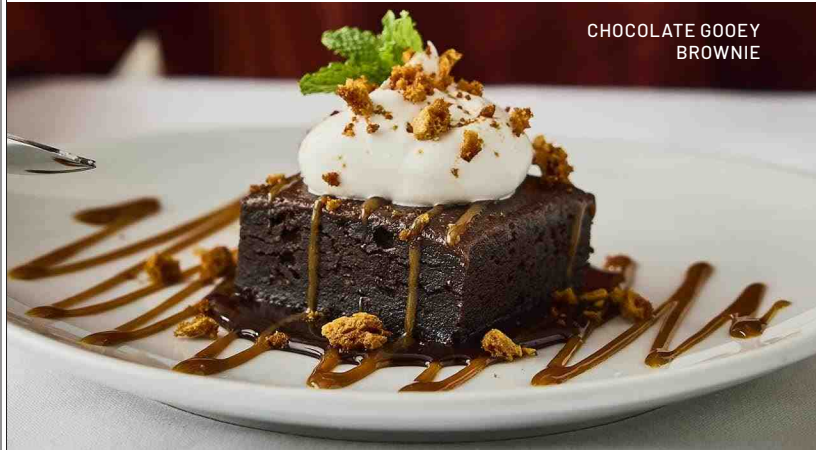
CHOCOLATE GOOEY BROWNIE