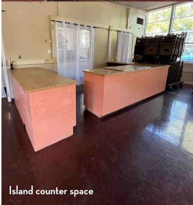
Island counter space