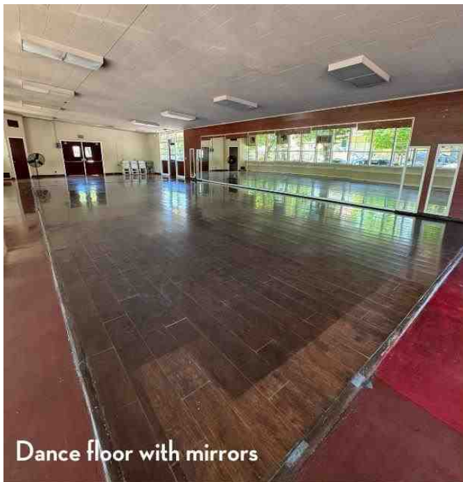
Dance floor with mirrors