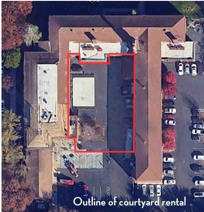
Outline of courtyard rental