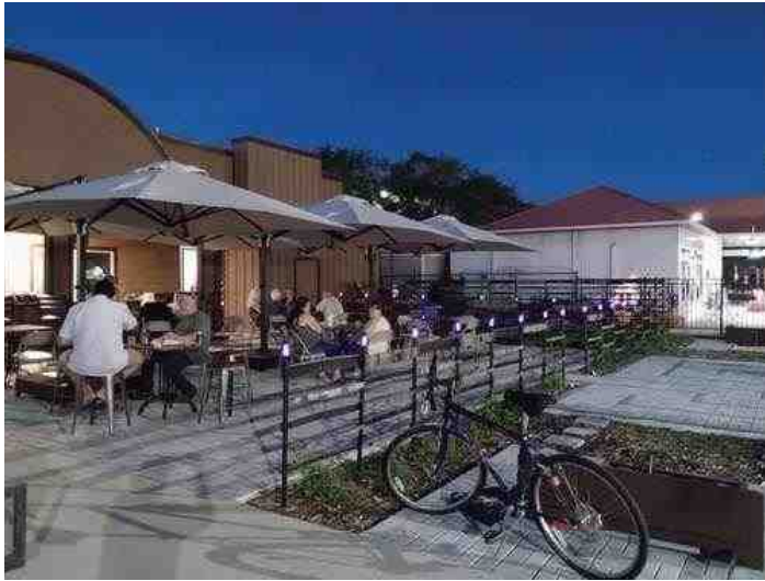
OUTSIDE PATIO - 30 PPL