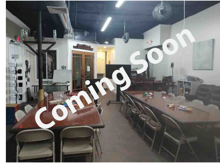
THE STUDIO - 70 PPL

NOTE: No outside food allowed except Broadway Pizza