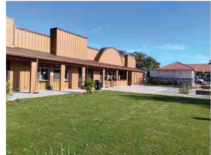
THE LAWN - 100 PPL