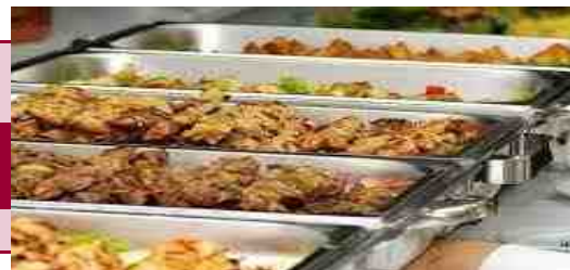
Wide Variety of Lunch and Dinner Options!