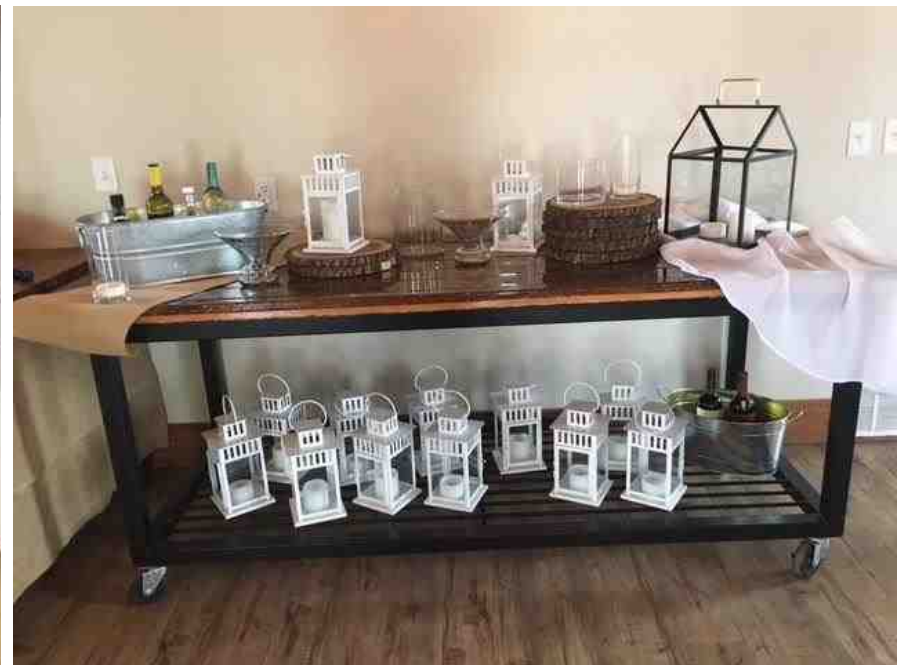
Various accessories you can use