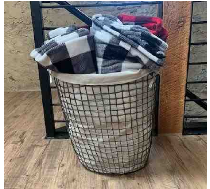
Sitting outside? We got you covered.