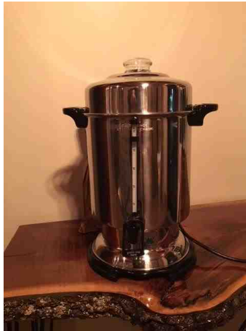
60 Cup Coffee Maker