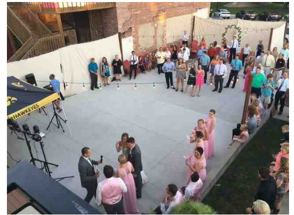
Music Lights and Dancing under the stars