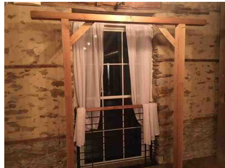
Indoors and Outdoors Cedar Beam Alters (2) you can decorate