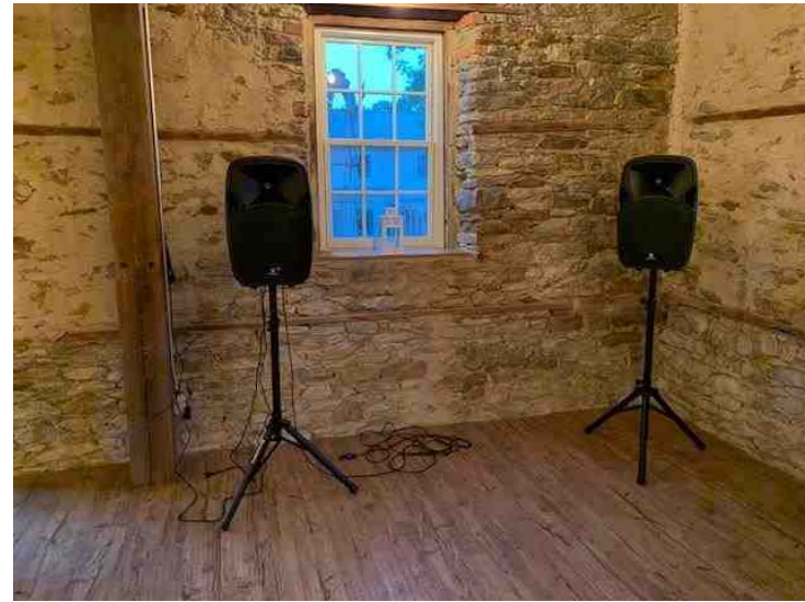
PRORECK PARTY 12 Portable Professional PA Speaker System (New July 2019) Bluetooth/USB/SD Card Reader FM Radio/Remote Control/Speaker Stand

For use indoor ceremony and speeches, or outdoor on the terrace during ceremony.