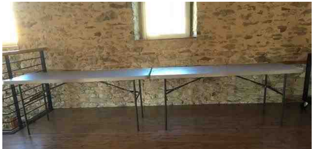
6'-Buffet Tables (5)