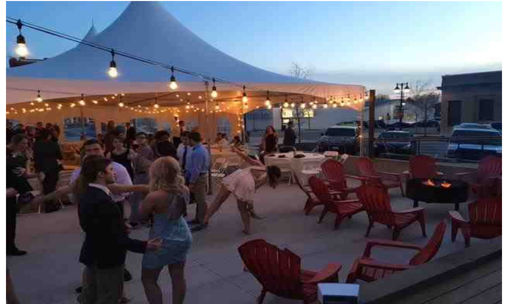
Front terrace and a Bonfire we will build, light, stoke and manage.