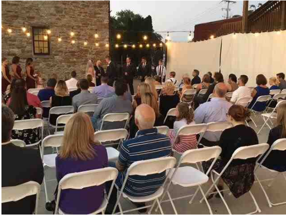
Outside Terrace Ceremony with String Lights