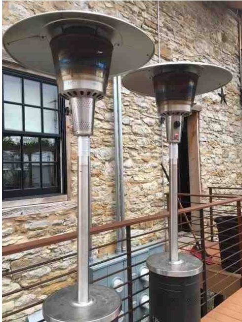
Commercial Patio Heaters (2) Option