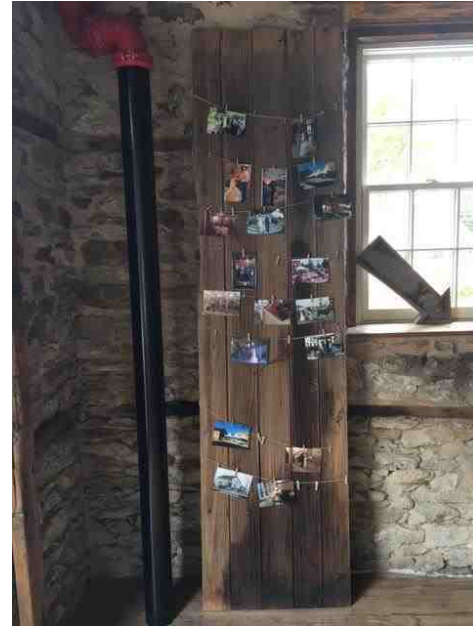
Entry barn door picture pinup