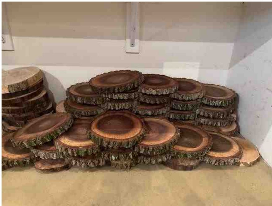
Newly cut each year live edge centerpieces