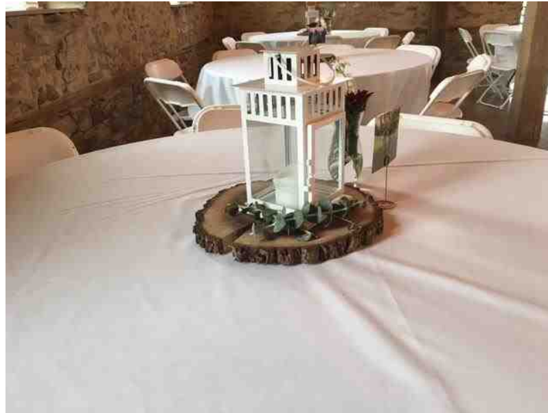
Typical center piece arrangement using all PHS acc.