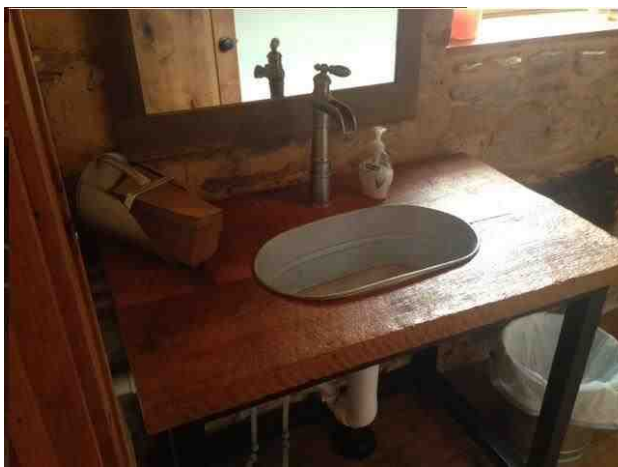
4 Rest Rooms