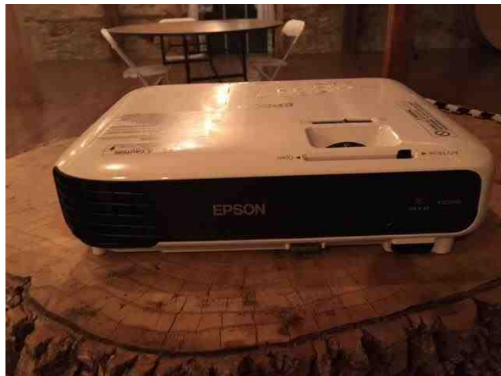
EPSON Projector and Screen

For use indoor ceremony and speeches, or outdoor on the terrace during ceremony.