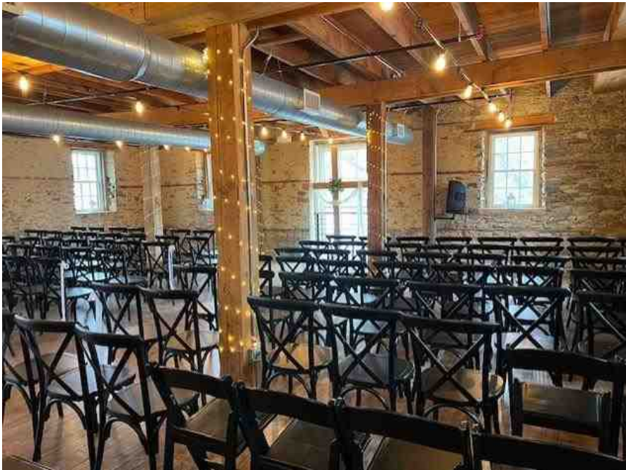
Black Wood Strap Back Chairs