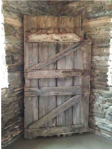
Rustic Back drop for photo booth