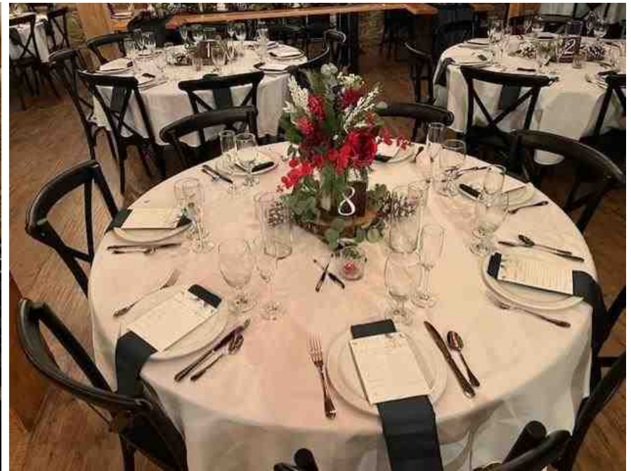
Round tables | Tablecloths Included