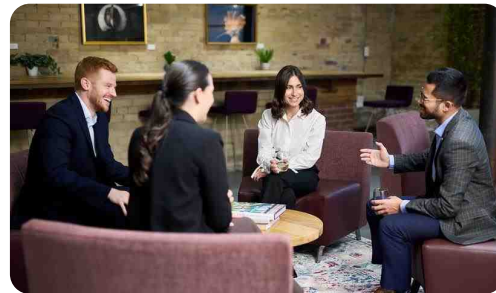
Corporate Holiday Parties