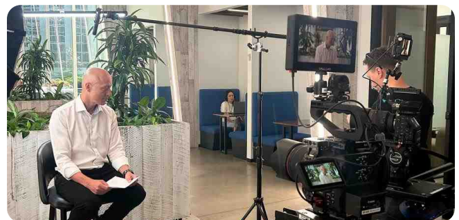
Photoshoots & Filming