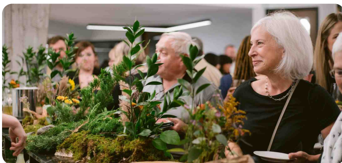
Weddings & Bridal Showers