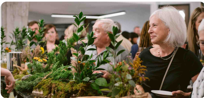
Weddings & Bridal Showers