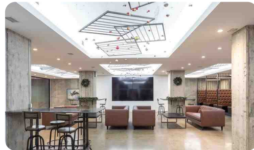
Corporate Holiday Parties